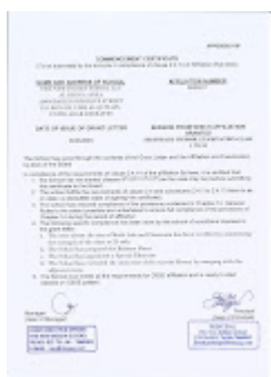
CBSE Appendix VIII.jpg 757K