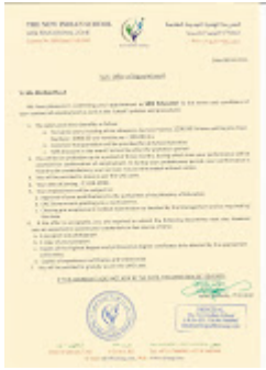
SEN Educator.jpg 787K