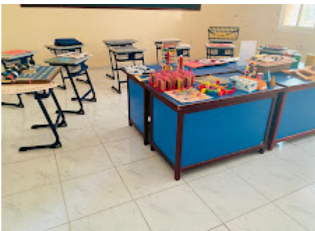
Math Lab-02.jpeg 93K