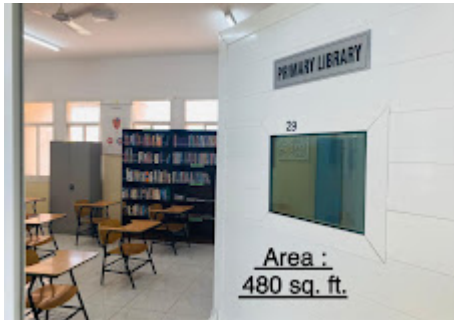
Primary Library-01.jpeg 96K